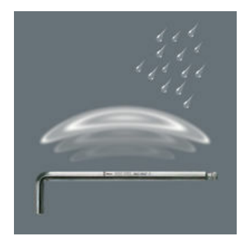
Chrome-plated hexagon L-keys for outstanding surface protection and long service life. High corrosion protection.