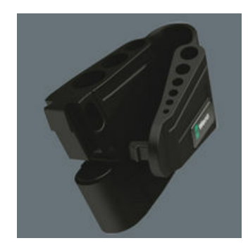
The wear-resistant clip material ensures that the L-keys are securely held yet are easy to remove.